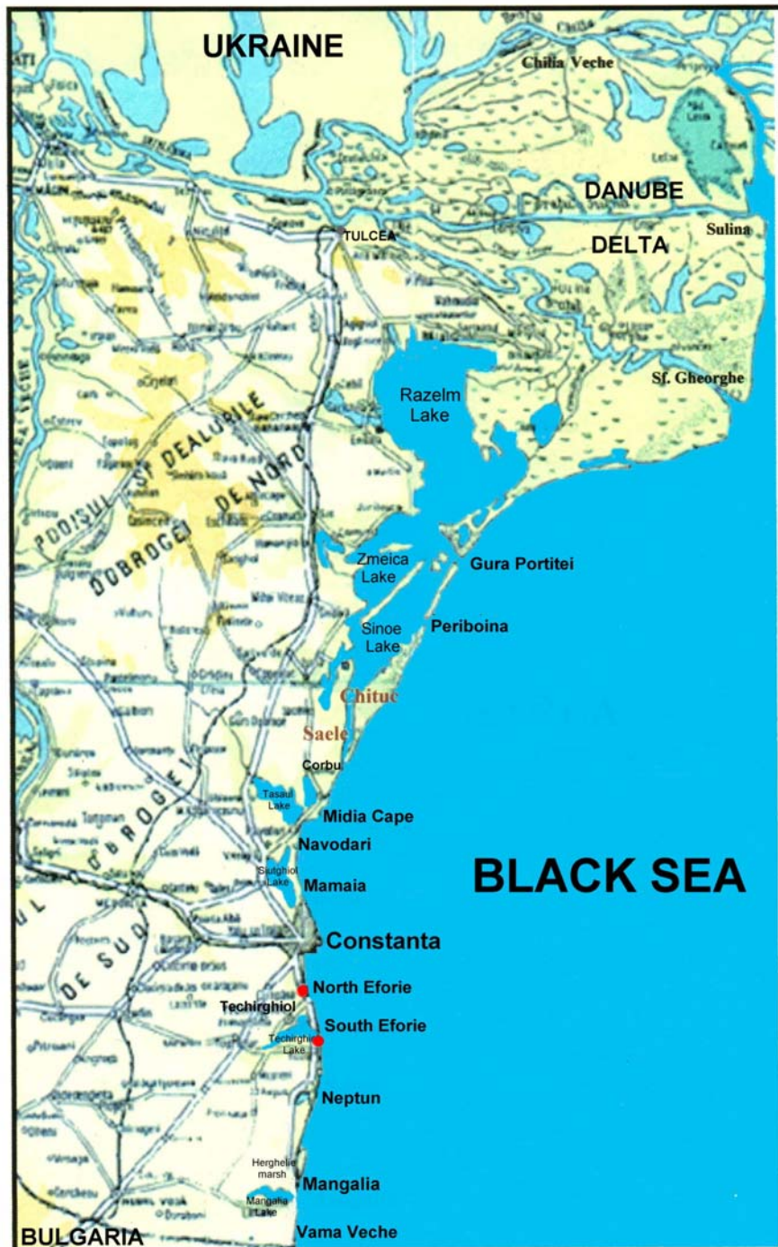
Fig. 1 – The geographical position of the area studied (44° 05' N latitude and 28° 40' E longitude)