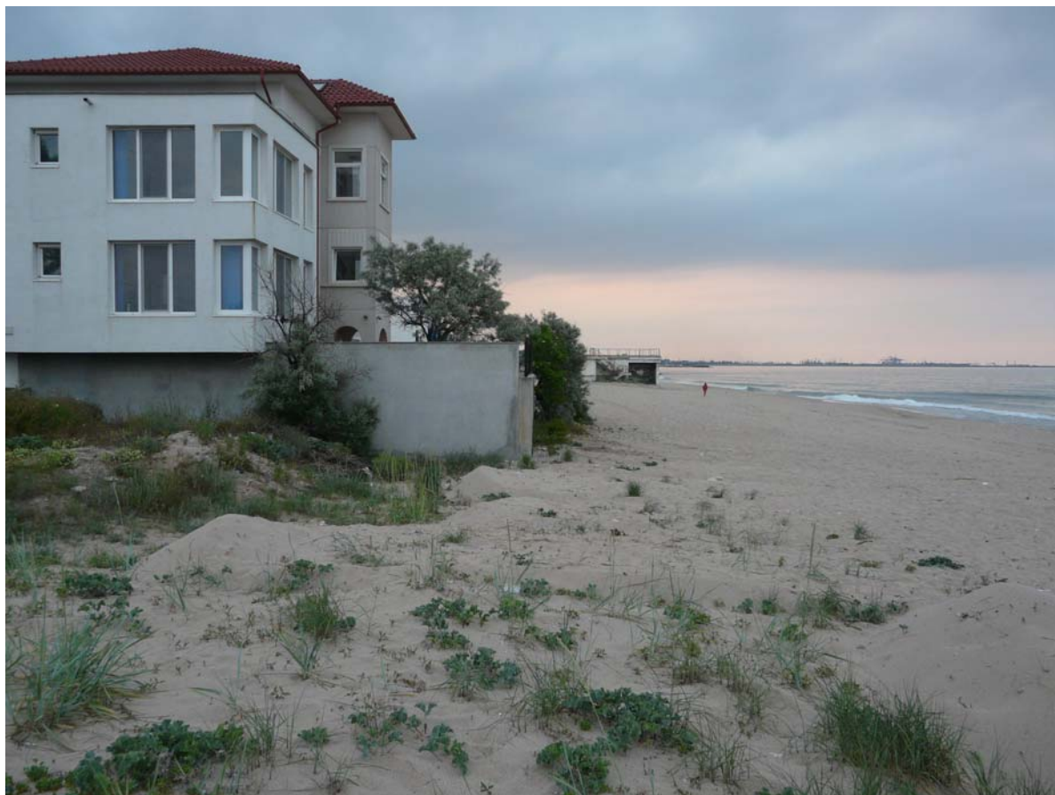
Fig. 2 – The building works in the proximity of sand dunes area between North and South Eforie